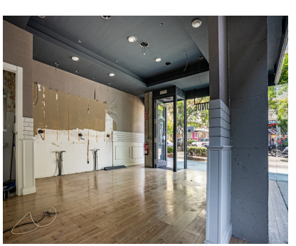
Ref.-ID: R5105197 Marbella Коммерческая