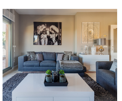
Ref.-ID: R5049313 Estepona

Коммунальные: 5,640 EUR / год ИБИ: 1,019 EUR / год