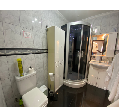
Ref.-ID: R5034424 Calahonda