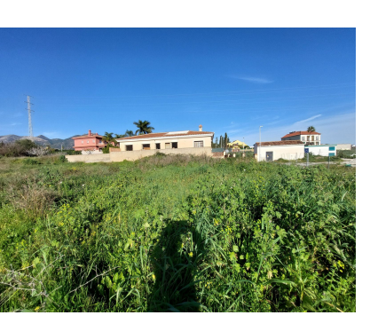
Ref.-ID: R5015131 Mijas Участок