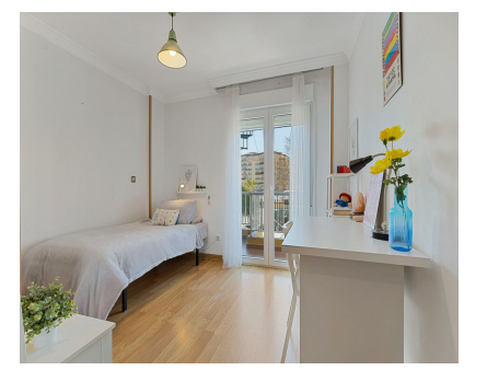
Ref.-ID: R5009290 Fuengirola