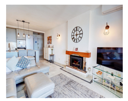
Ref.-ID: R5003917 Calahonda