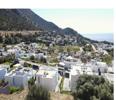
Ref.-ID: R5002621 Mijas Участок