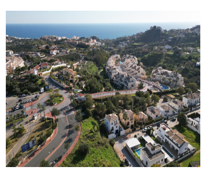
Ref.-ID: R4956979 Benalmadena