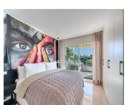
Ref.-ID: R4954525 The Golden Mile

Коммунальные: 3,600 EUR / год ИБИ: 1,038 EUR / год