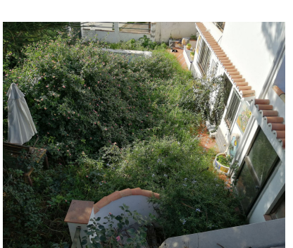
Ref.-ID: R4742092 Torremolinos Участок