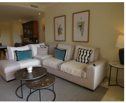
Elviria Ref.-ID: R5077300 Апартамент