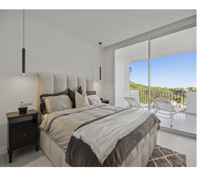
Ref.-ID: R5063743 Benahavís