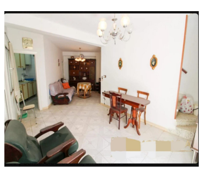
Ref.-ID: R5058370 Coín Дом