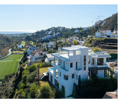
Коммунальные: 600 EUR / год