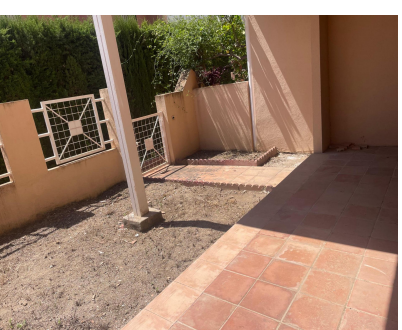
Ref.-ID: R5044264 Arroyo de la Miel

Коммунальные: 1,020 EUR / год ИБИ: 870 EUR / год