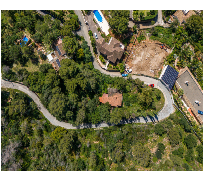
Ref.-ID: R5012356 Marbella Участок

ИБИ: 2,252 EUR / год Mycop: 278 EUR / год