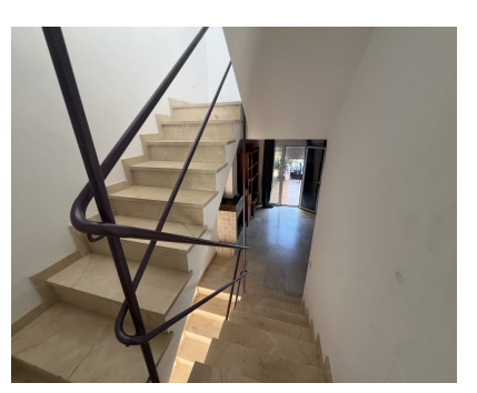
Ref.-ID: R5008723 Marbella Апартамент