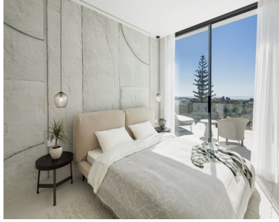
Ref.-ID: R4993171 La Quinta Дом