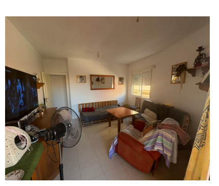
Los Pacos Ref.-ID: R4992055