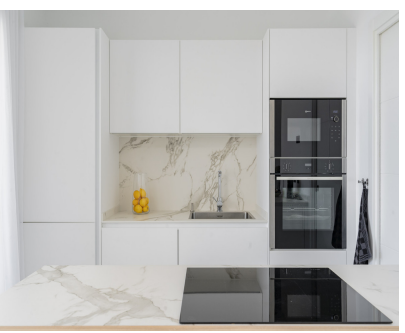
Ref.-ID: R4954591 Estepona Апартамент