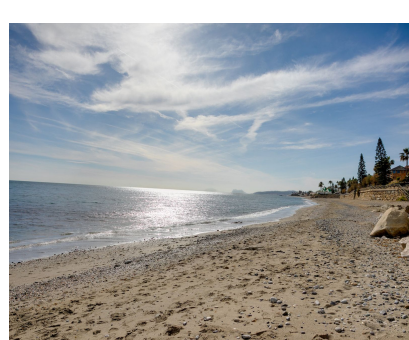
Ref.-ID: R4915192 Estepona Дом