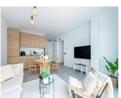
Ref.-ID: R4922275 Nueva Andalucía Apartment