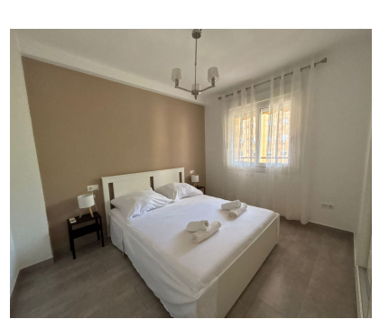
Ref.-ID: R5080795 Fuengirola Apartment