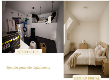
Ejemplo generado digitalmente

www.arbatestates.com +34 606 84 36 45 +34 602 51 80 97 info@arbatestates.com