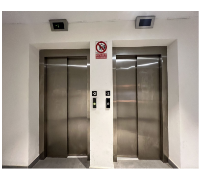
Ref.-ID: R5117092 Estepona Commercial