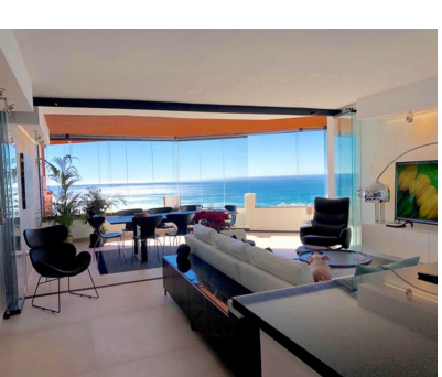
Ref.-ID: R5110828 Benalmadena