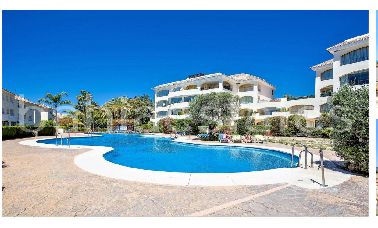
Bahía de Marbella