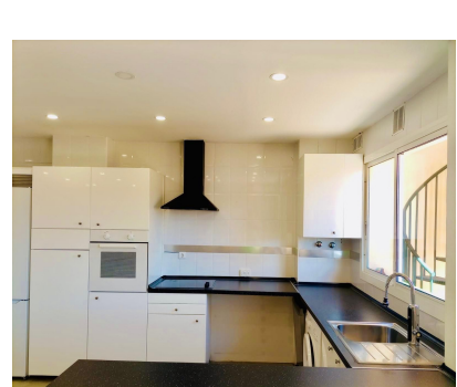
Ref.-ID: R5104342 Fuengirola