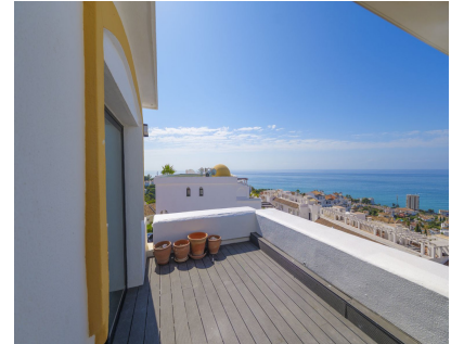
Riviera del Sol