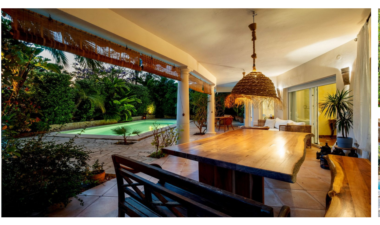
Reserva de Marbella

IBI: 1,625 EUR / year Rubbish: 185 EUR / year