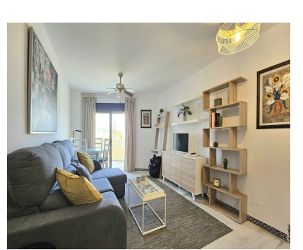
Ref.-ID: R5073958 La Cala de Mijas

Community: 2,100 EUR / year IBI: 489 EUR / year