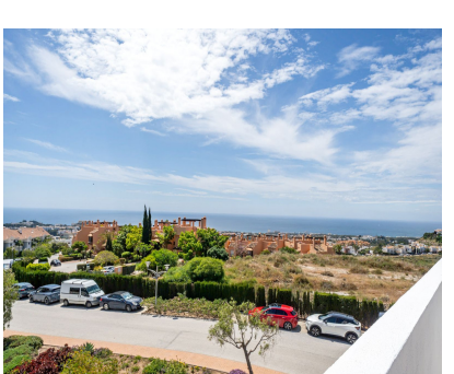
Ref.-ID: R5061859 Calanova Golf