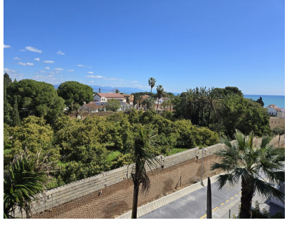
Ref.-ID: R5057665 Torremolinos Apartment