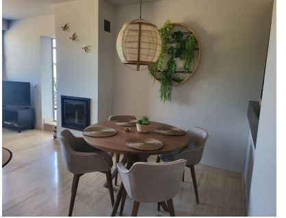
Ref.-ID: R5055814 La Cala de Mijas