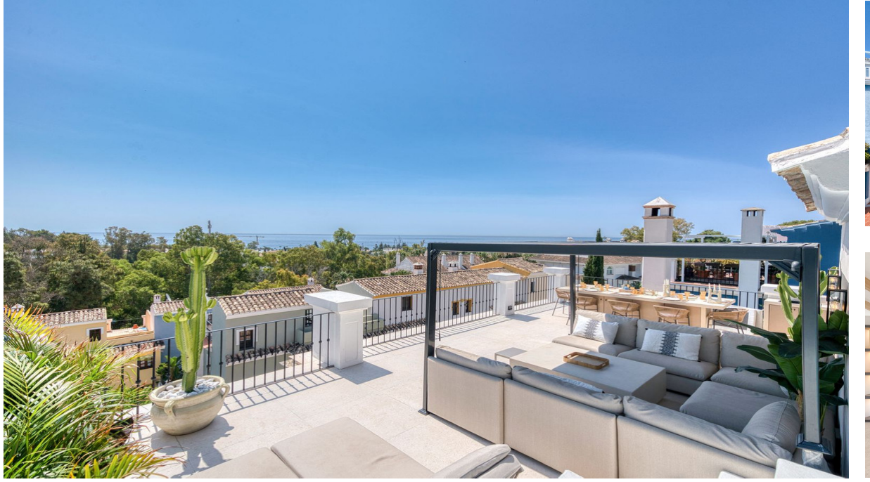
The Golden Mile

IBI: 2,207 EUR / year Rubbish: 93 EUR / year