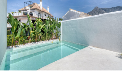
Community: 1,800 EUR / year