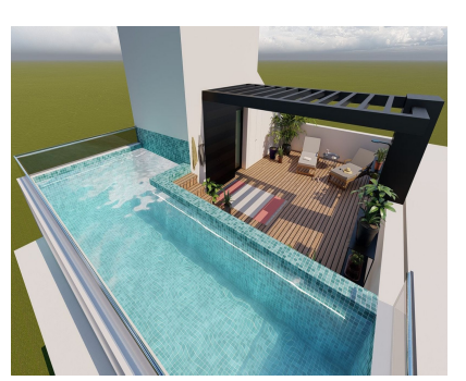
Ref.-ID: R5052553 Estepona Plot