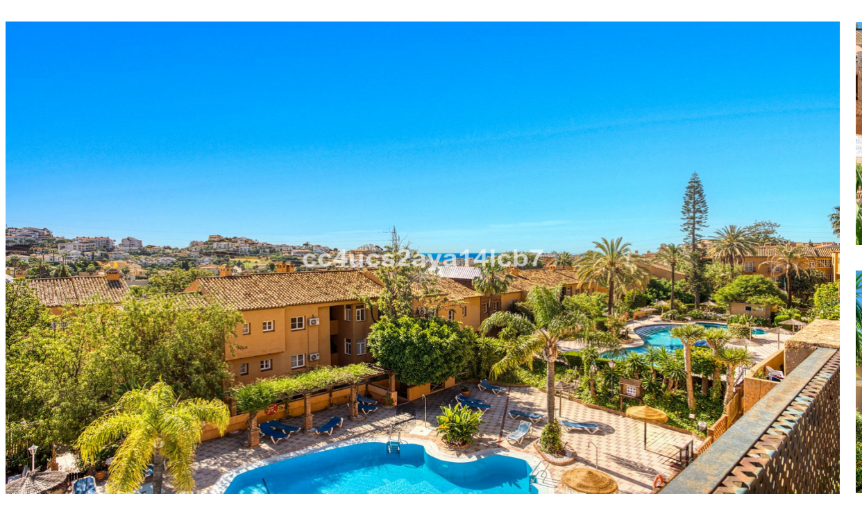
Riviera del Sol