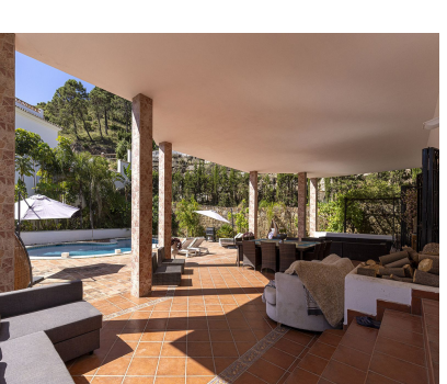
Ref.-ID: R5050594 Benahavís