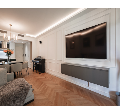
Ref.-ID: R5049580 Benahavís

Community: 3,756 EUR / year IBI: 464 EUR / year