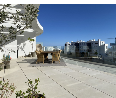
Ref.-ID: R5047432 Fuengirola