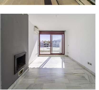
Community: 3,120 EUR / year