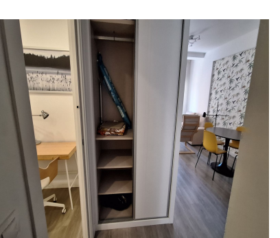
Ref.-ID: R5037406 Fuengirola