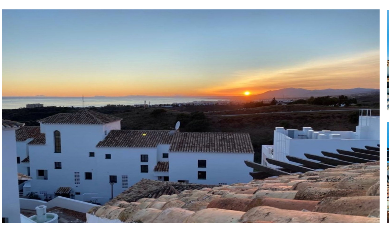
Altos de los Monteros