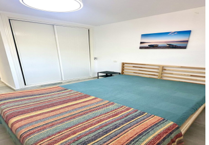
Ref.-ID: R5021989 Riviera del Sol