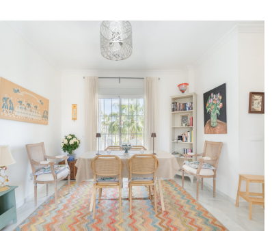
Ref.-ID: R5021467 Estepona