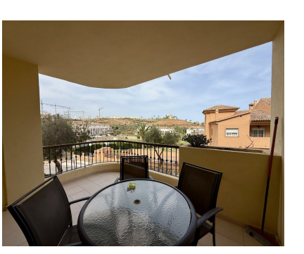
Ref.-ID: R5013619 La Cala