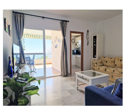
Ref.-ID: R5009575 Miraflores

Community: 1,440 EUR / year IBI: 485 EUR / year