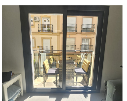
Ref.-ID: R5009200 Fuengirola