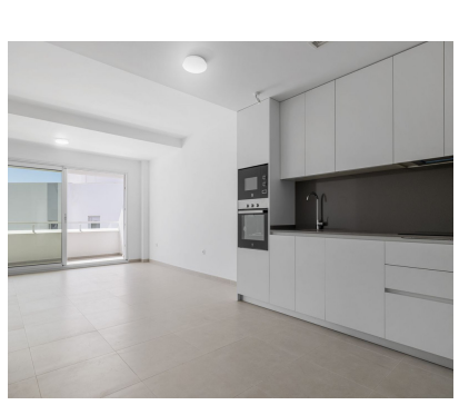
Ref.-ID: R5006287 Cancelada