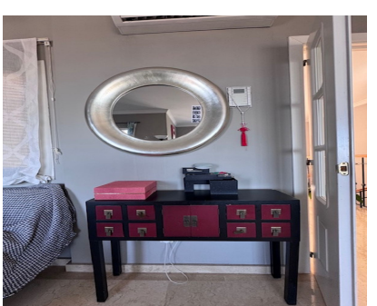
Ref.-ID: R5002051 La Mairena

Community: 1,668 EUR / year IBI: 800 EUR / year Rubbish: 180 EUR / year